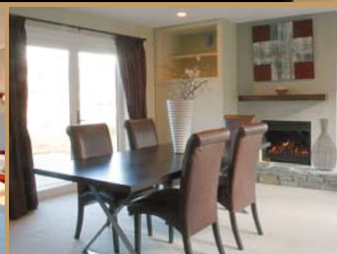
Main picture: Living area. Left to right: Den, master bedroom, master bedroom ensuite, dining area. Back page: Exterior front facing.

Designed for relaxed living, this friendly, warm and comfortable home has a tastefully decorated kitchen and dining area. The in-built desk on one side doubles as a sideboard or an office space. The dining area opens up on to the patio, as does the den.